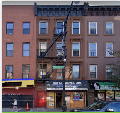
215 McCLELLAN ST