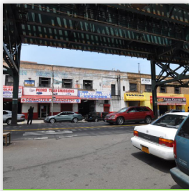
1959 JEROME AVE