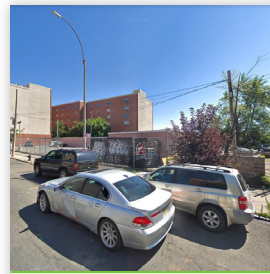
1420 & 1422 STEBBINS AVE