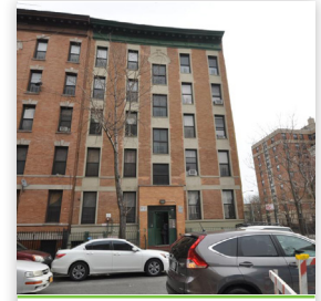
1100 CLAY AVE