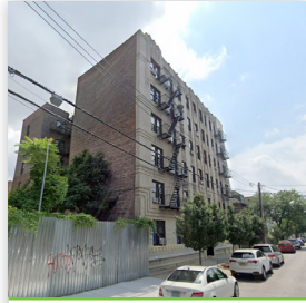
1710-1730 POPHAM AVE