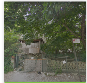
1472 SHAKESPEARE AVE