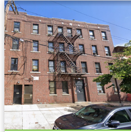
2238 VALENTINE AVE