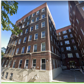
1860 BILLINGSLEY TERR