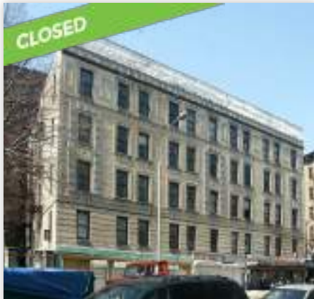
346 East 173rd Street