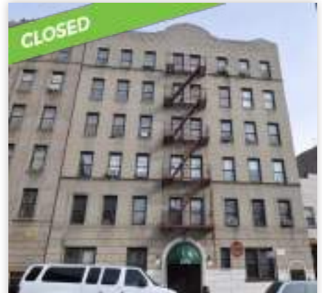
2170 Creston Avenue