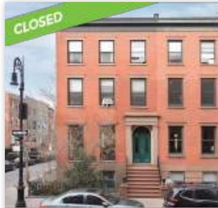
109 State Street