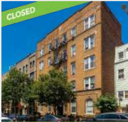
225 13th Street