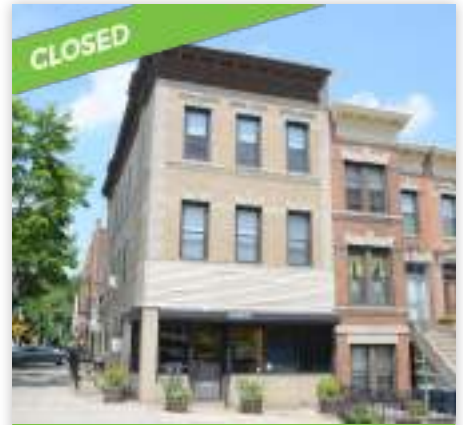
255 Windsor Place