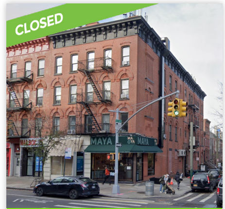
317-327 7th Avenue