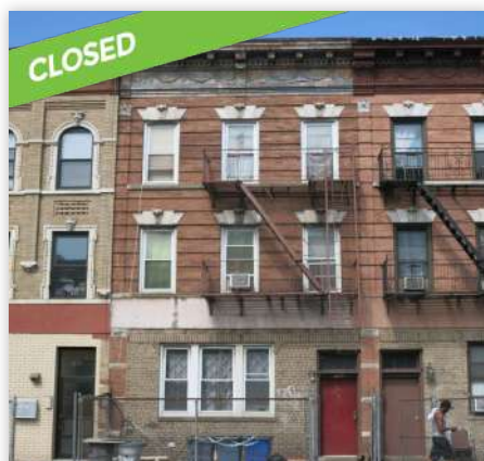
1064 Rogers Avenue