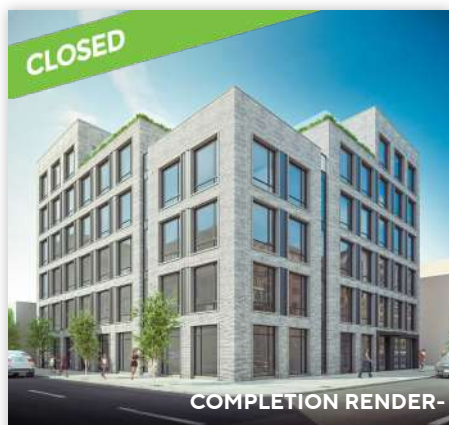
533 Albany Avenue