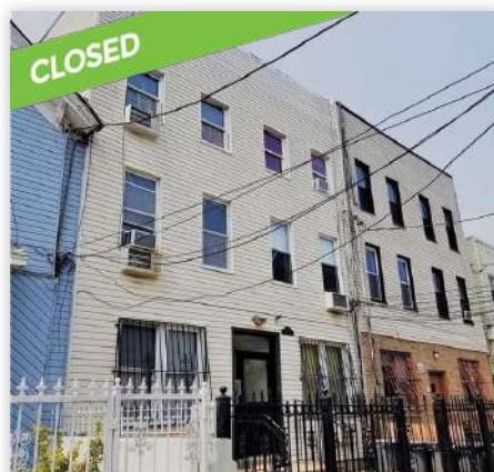
268 Linwood Street