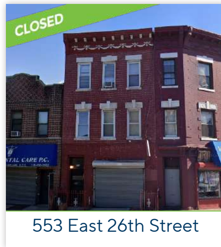
553 East 26th Street