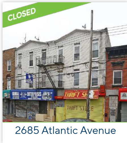
2685 Atlantic Avenue