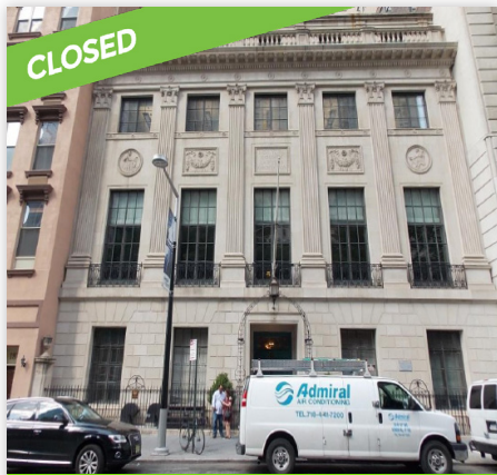
14 Vesey Street