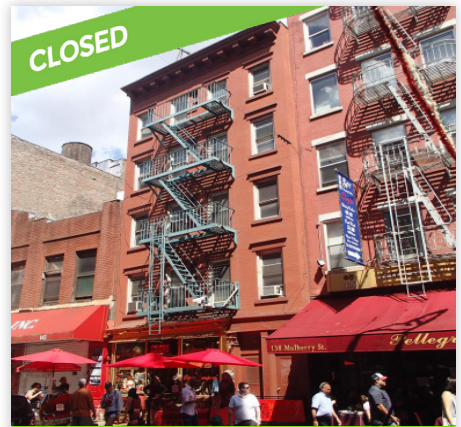
140 Mulberry Street