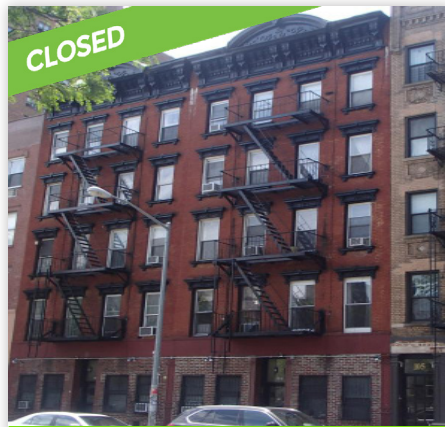
107-109 East 2nd Street