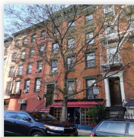
405 E 6TH ST