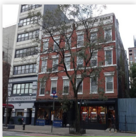
45-47 2ND AVE