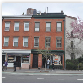
23 8TH AVE