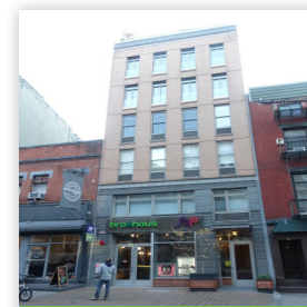
381 BROOME ST