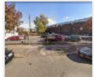
47-25 44TH ST