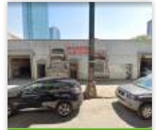
45-17 DAVIS ST