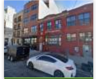
39-31 29TH ST