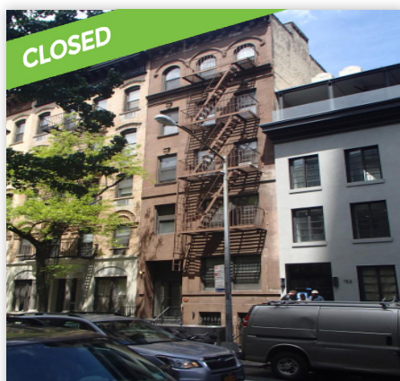
151 E 30th Street