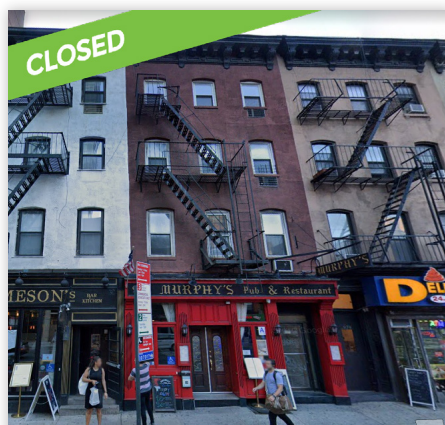
977 2nd Avenue