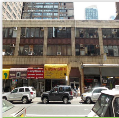
155-165 W 29TH ST