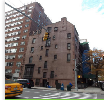
130 E 37TH ST