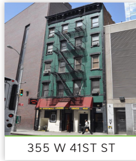
355 W 41ST ST