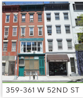
359-361 W 52ND ST