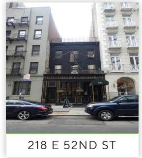
218 E 52ND ST