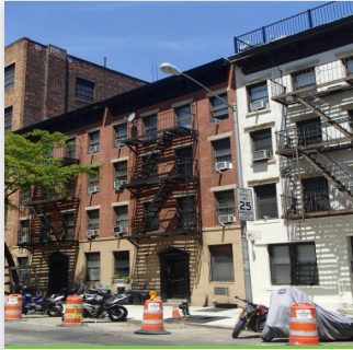
335-337 E 21ST ST