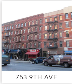
753 9TH AVE