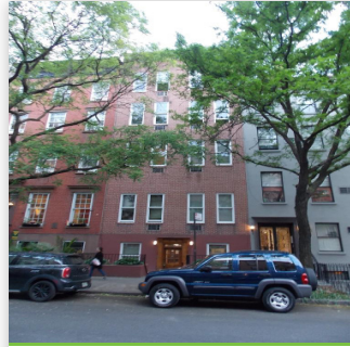
320 W 22ND ST