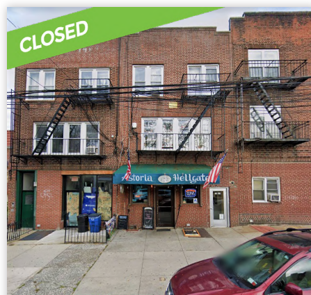
1919 Ditmars Boulevard