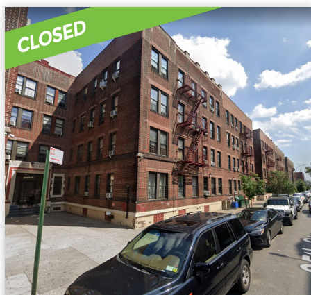
3525-3535 95th Street