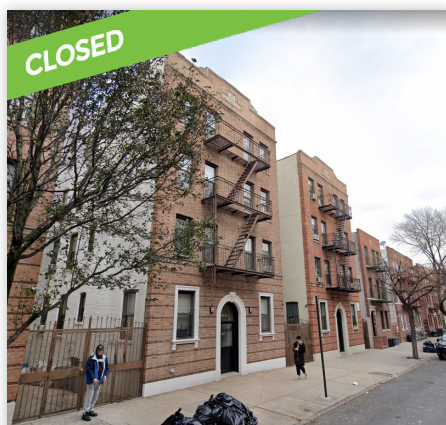
31-56 34th Street