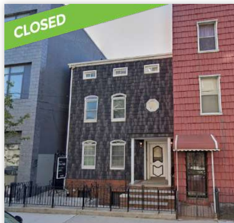
206 North 8th Street