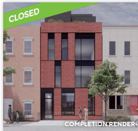
151 Freeman Street