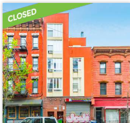
149 Franklin Street