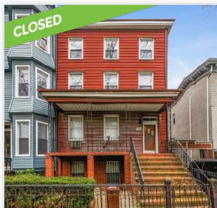
31 Orient Avenue