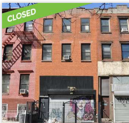
742 Driggs Avenue