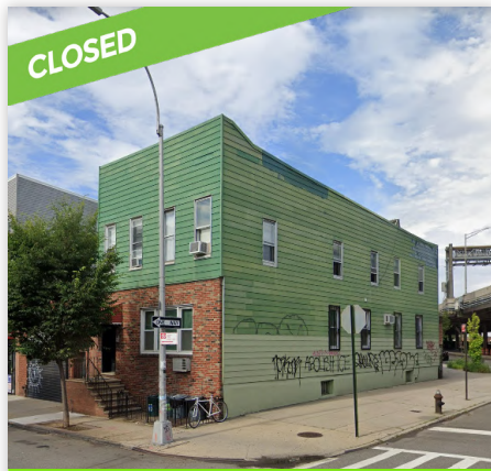
676 Lorimer Street