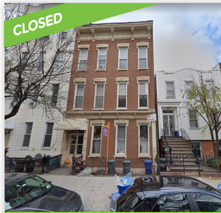
103 India Street