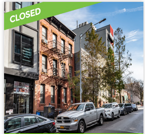
91 N 4th Street