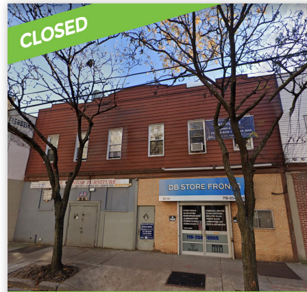
18-14 Astoria Boulevard