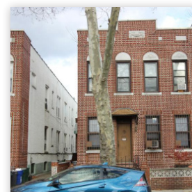
2071 68TH ST