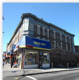
5502 5TH AVE