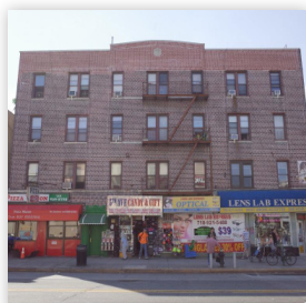
482 86TH ST