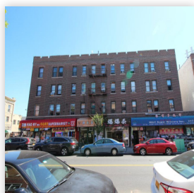
702 54TH ST