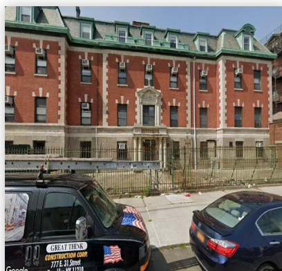
1222 63RD ST