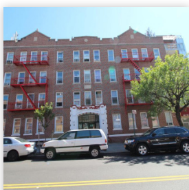
5413 7TH AVE