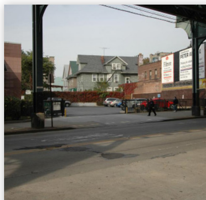
7108-7120 NEW UTRECHT AVE