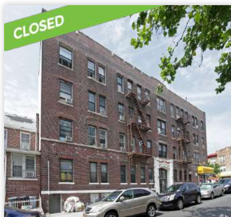
702 54th Street