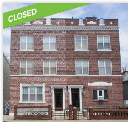
1469-1471 Bay Ridge Pkwy