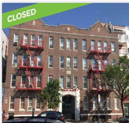
5413 7th Avenue