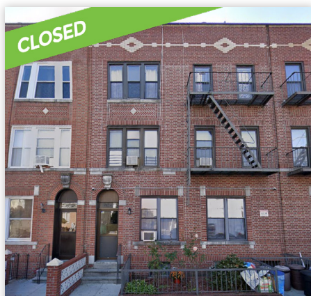
2054 77th Street