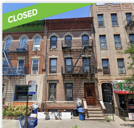
6320 14th Avenue