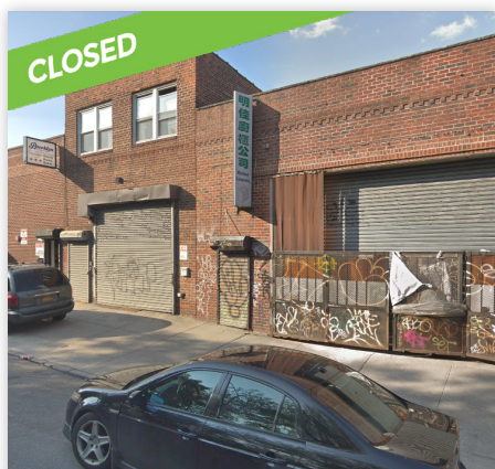
1355 61st Street