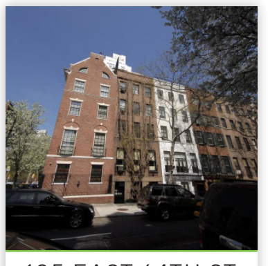
105 EAST 64TH ST