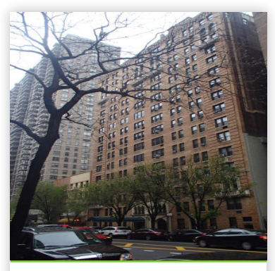
325 EAST 79TH ST