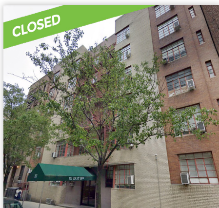
151 East 90th Street