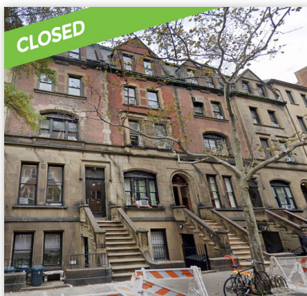
61 West 73rd Street