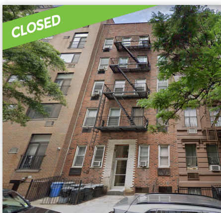
427 East 80th Street