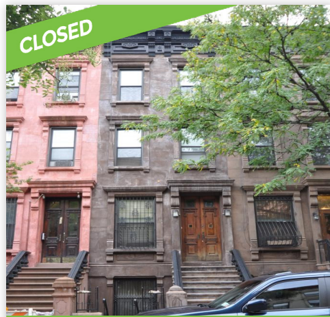
234 West 132nd Street