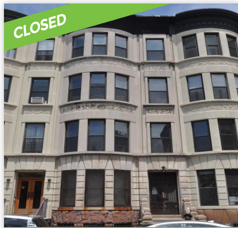
107 West 117th Street