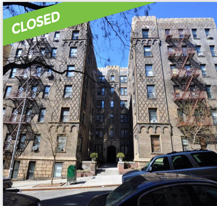
106-114 Pinehurst Ave