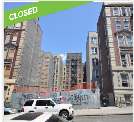
521 West 134th Street