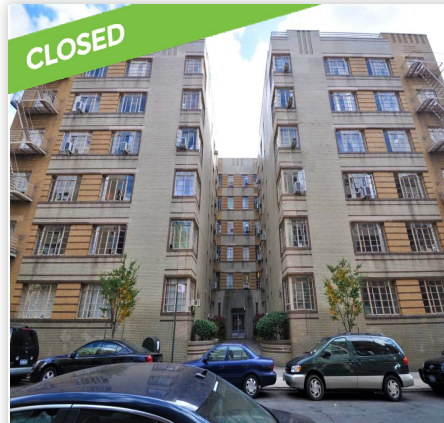
101 Cooper Street