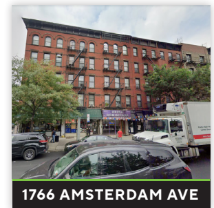
1766 AMSTERDAM AVE