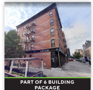
PART OF 6 BUILDING PACKAGE