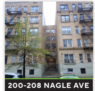
200-208 NAGLE AVE