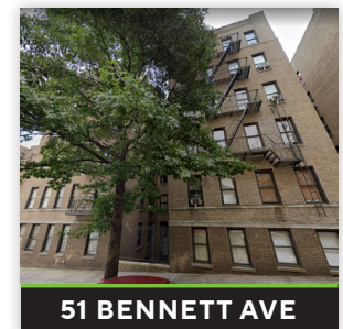
51 BENNETT AVE