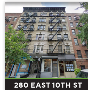
280 EAST 10TH ST