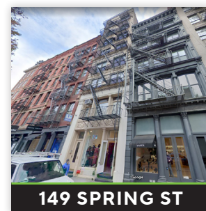
149 SPRING ST