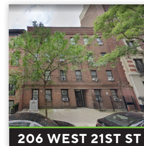
206 WEST 21ST ST