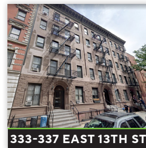
333-337 EAST 13TH ST