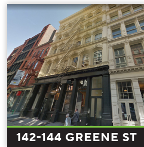
142-144 GREENE ST