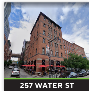
257 WATER ST