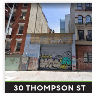
30 THOMPSON ST