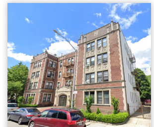
8116-8124 RIDGE BLVD