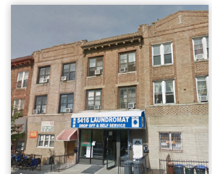
5416 7TH AVE