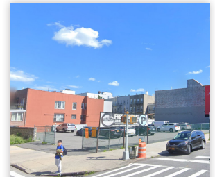
8101 3RD AVE