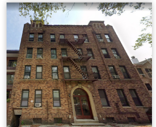
425 101ST ST