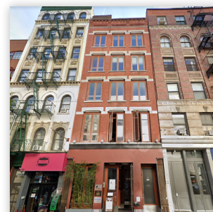
206 SPRING ST