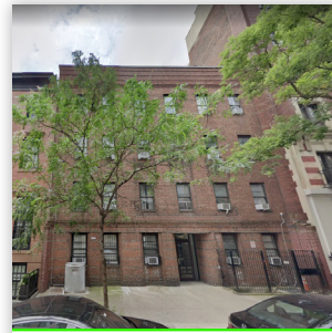
206 WEST 21ST ST