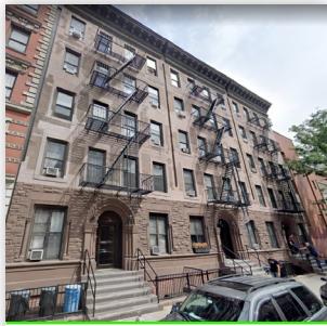
333, 335, 337 EAST 13TH ST