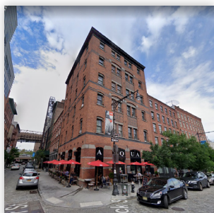
257 WATER ST