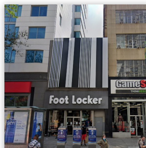
34 EAST 14TH ST