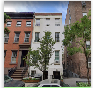
105 BANK ST