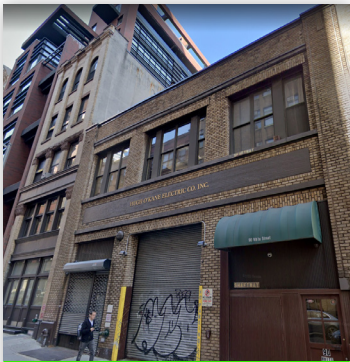
30 THOMPSON ST