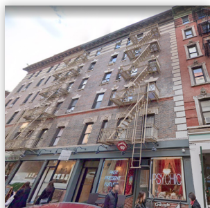
35 BEDFORD ST