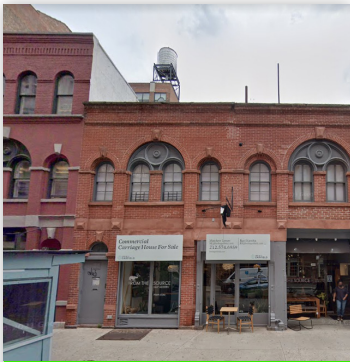
130 WEST 18TH ST