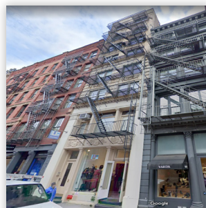
149 SPRING ST