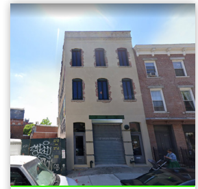
663 DRIGGS AVE