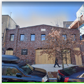
60 NORTH 6TH ST