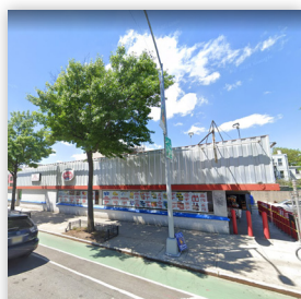
575 GRAND ST