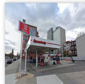
210 GREENPOINT AVE