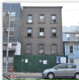
583 LORIMER ST