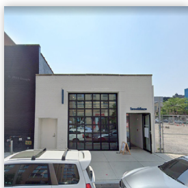
127 KENT AVE