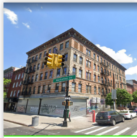
972 MANHATTAN AVE