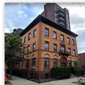
484 HUMBOLDT ST