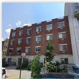
4 BUILDING PACKAGE