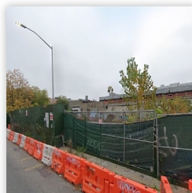
244 SEIGEL ST