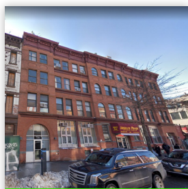
740-750 GRAND ST