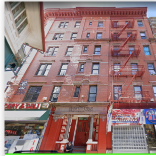
1039 SIMPSON ST