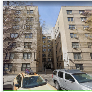
955 SHERIDAN AVE