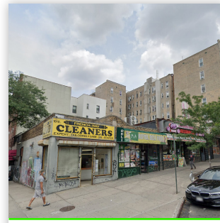
101-115 EAST MOUNT EDEN AVE