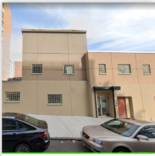
860 COURTLANDT AVE