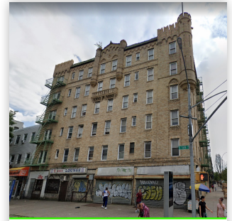
718-726 EAST 149TH ST