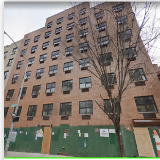
1978 ANTHONY AVE