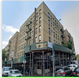
1127 SHERIDAN AVE