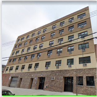
2001 ARTHUR AVE