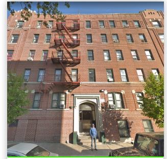
1801 & 1809 MARMION AVE