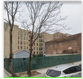
53 EAST 177TH ST