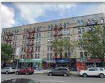
PART OF A 9 BUILDING PORTFOLIO

*Development Site / Buildable Square Footage