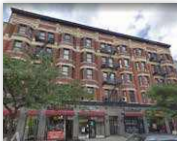
17-27 WEST 125TH ST