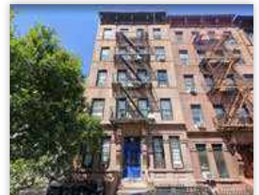
167 EAST 102ND ST