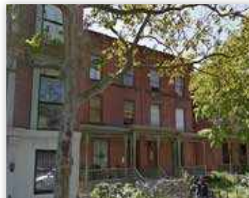
10 WEST 130TH ST