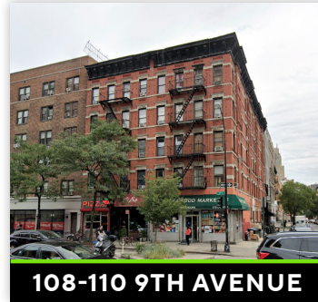
108-110 9TH AVENUE