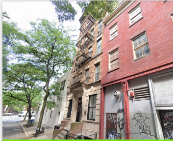
16 BARROW STREET