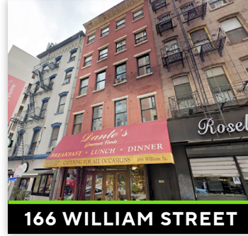
166 WILLIAM STREET