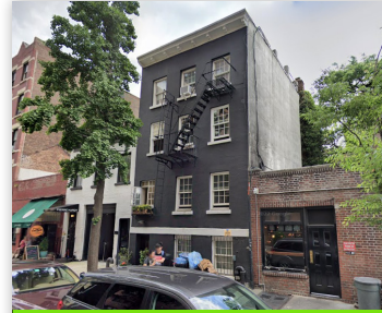
32 JANE STREET