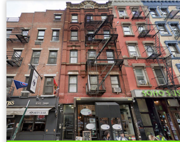
235 SULLIVAN STREET