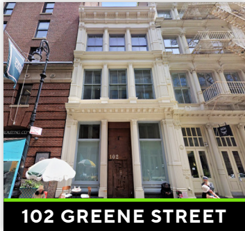
102 GREENE STREET