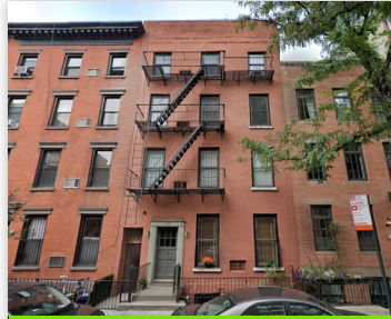
305 WEST 20TH STREET