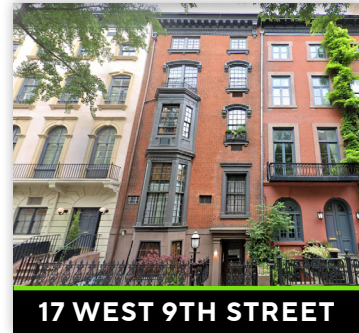
17 WEST 9TH STREET