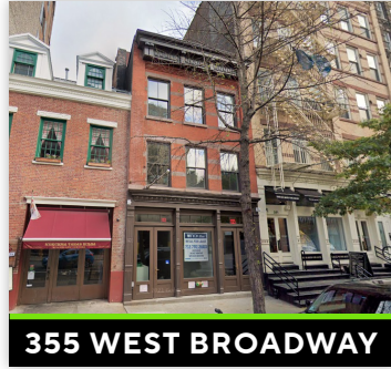
355 WEST BROADWAY