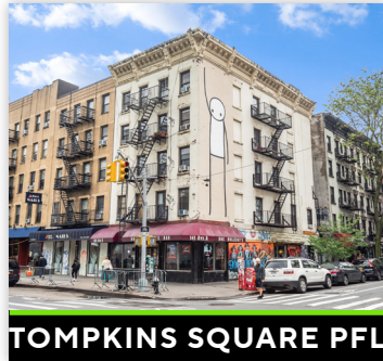
TOMPKINS SQUARE PFL