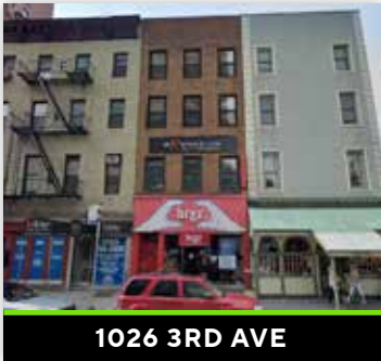
1026 3RD AVE