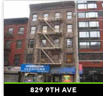
829 9TH AVE