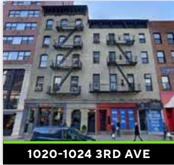
1020-1024 3RD AVE