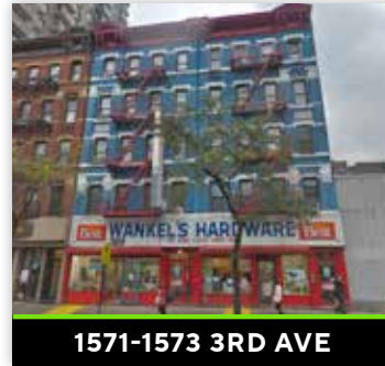
1571-1573 3RD AVE