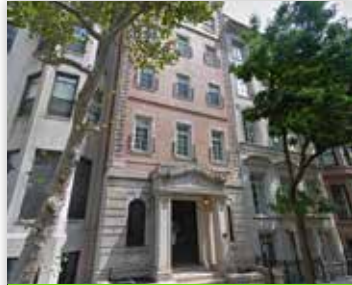
5 EAST 63RD ST