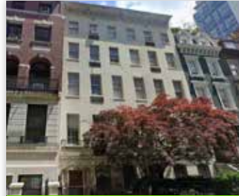
111 EAST 38TH ST