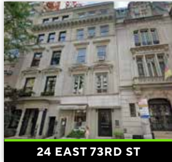
24 EAST 73RD ST