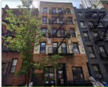
PART OF 3 BUILDING PKG