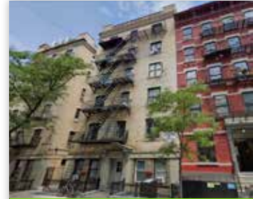
541 WEST 49TH ST