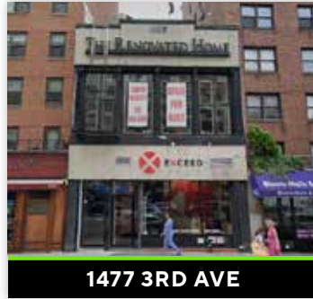
1477 3RD AVE