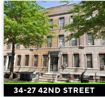
34-27 42ND STREET