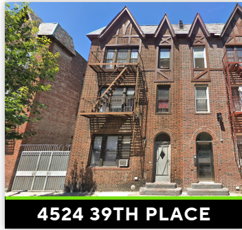
4524 39TH PLACE