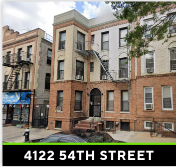
4122 54TH STREET