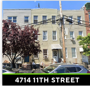
4714 11TH STREET