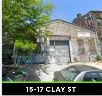
15-17 CLAY ST