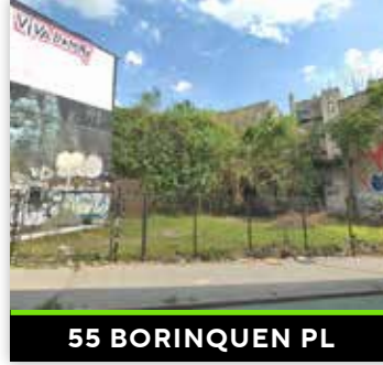
55 BORINQUEN PL