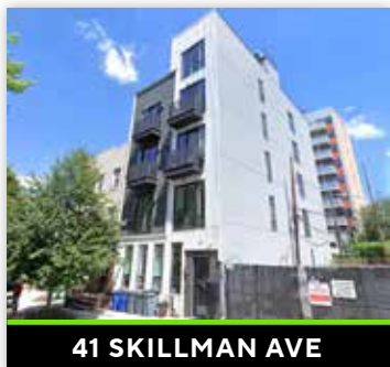
41 SKILLMAN AVE