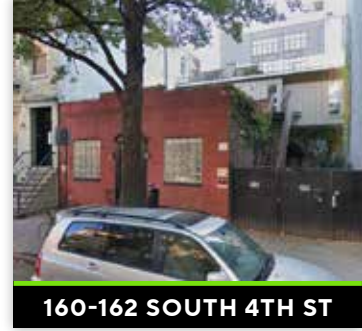
160-162 SOUTH 4TH ST