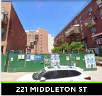
221 MIDDLETON ST