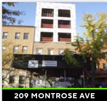
209 MONTROSE AVE