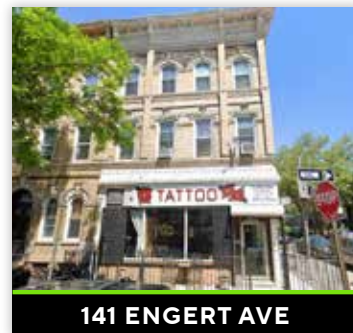
141 ENGERT AVE