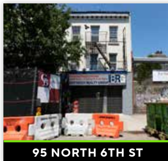
95 NORTH 6TH ST