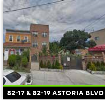
82-17 & 82-19 ASTORIA BLVD