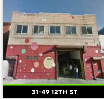
31-49 12TH ST