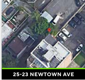
25-23 NEWTOWN AVE