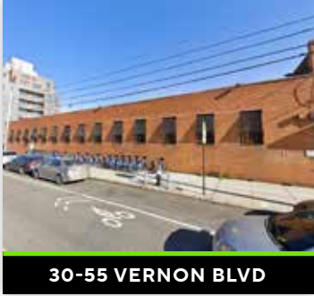
30-55 VERNON BLVD