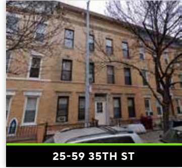
25-59 35TH ST