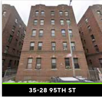
35-28 95TH ST