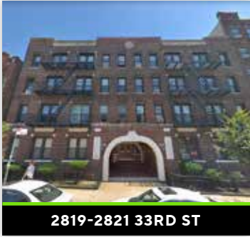
2819-2821 33RD ST