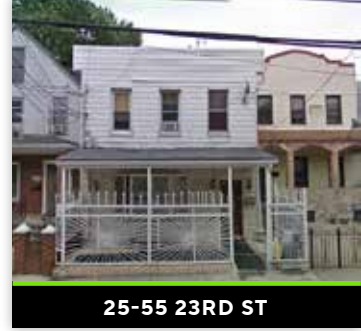
25-55 23RD ST