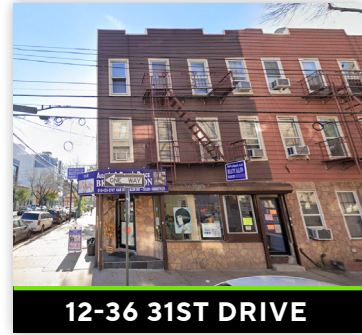
12-36 31ST DRIVE