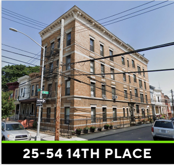
25-54 14TH PLACE