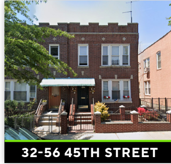
32-56 45TH STREET