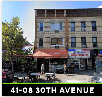
41-08 30TH AVENUE