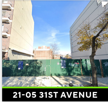
21-05 31ST AVENUE