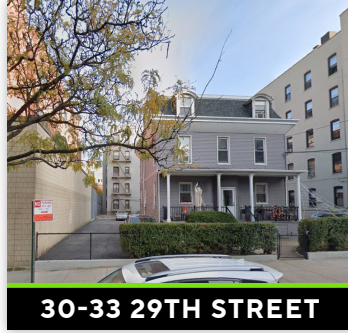
30-33 29TH STREET