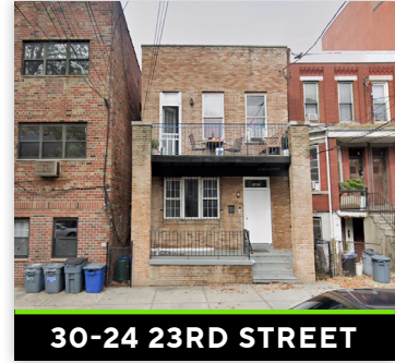
30-24 23RD STREET