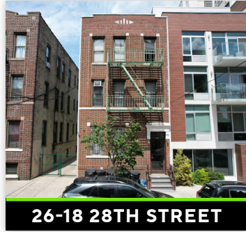
26-18 28TH STREET