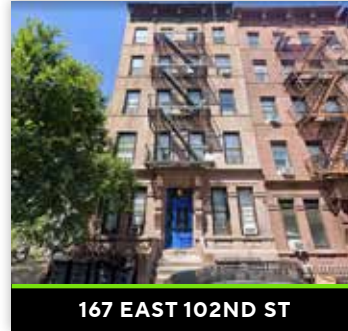
167 EAST 102ND ST