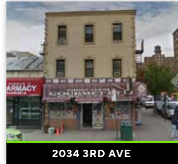
2034 3RD AVE