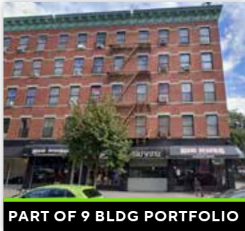
PART OF 9 BLDG PORTFOLIO