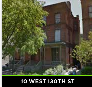
10 WEST 130TH ST