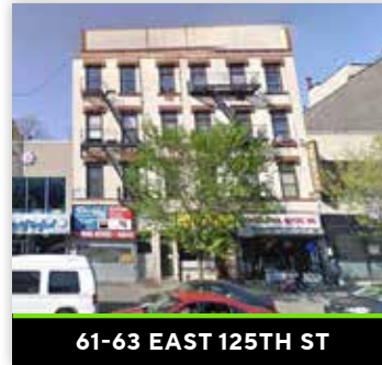
61-63 EAST 125TH ST