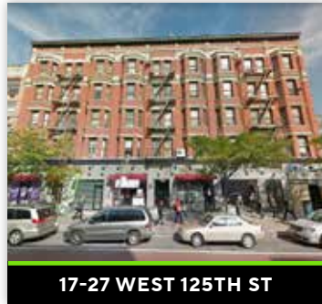
17-27 WEST 125TH ST