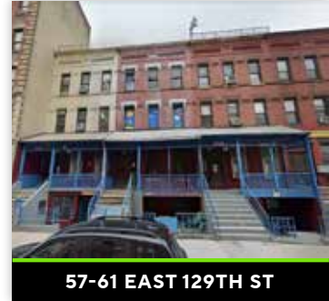
57-61 EAST 129TH ST