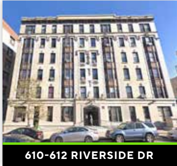
610-612 RIVERSIDE DR