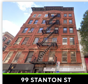
99 STANTON ST