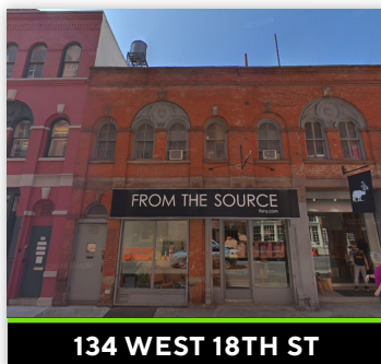
134 WEST 18TH ST