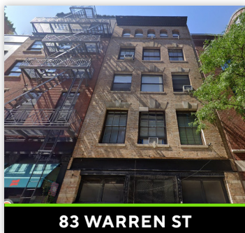
83 WARREN ST