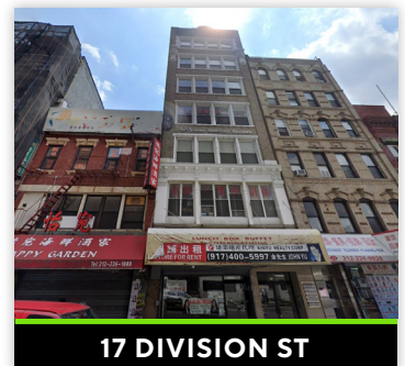
17 DIVISION ST