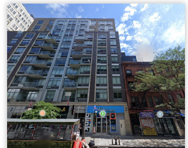
304 8TH AVE