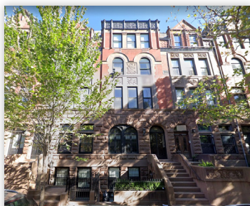
131 WEST 77TH ST