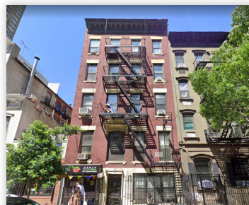
459 WEST 50TH ST