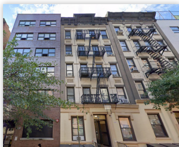
434-436 EAST 76TH ST