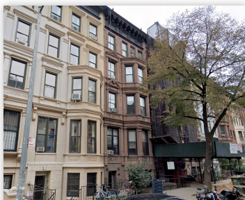
43 WEST 75TH STREET