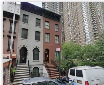
409 EAST 58TH STREET