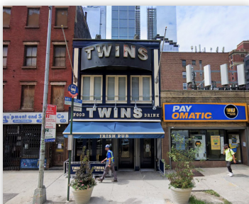
421 9TH AVENUE