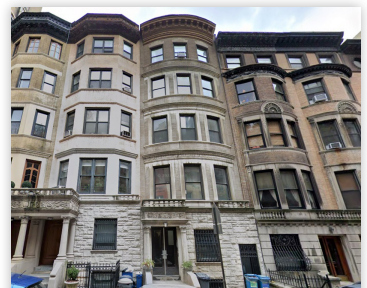
308 WEST 78TH STREET