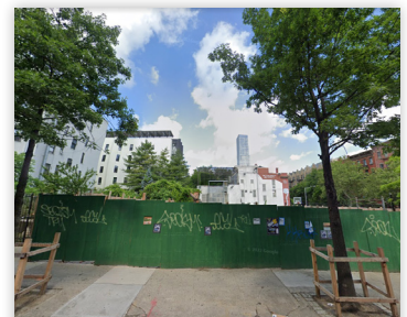
1578 LEXINGTON AVE