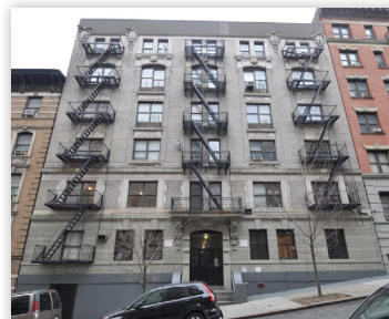
617 WEST 143RD ST