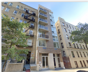
703 WEST 171ST ST