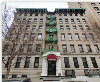
545 EDGECOMBE AVE

*Development Site / Buildable Square Footage