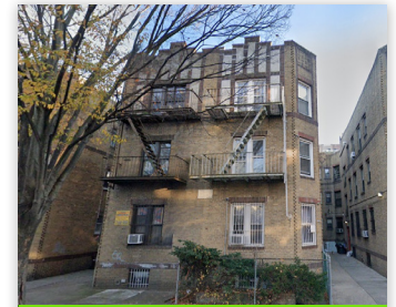
58-34 43RD AVE