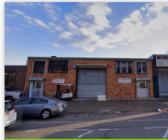
62-10 34TH AVE