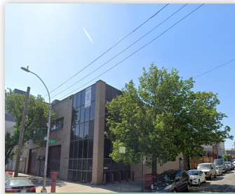
11-02 37TH AVE