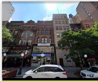
230 WEST 72ND ST