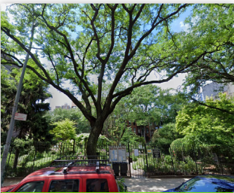
444 WEST 48TH ST