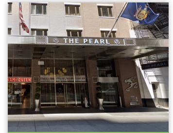
249 WEST 49TH ST