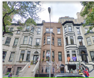
330 WEST 87TH ST