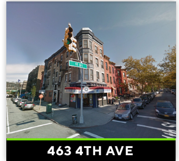
463 4TH AVE