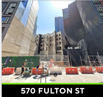
570 FULTON ST