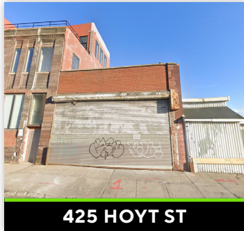
425 HOYT ST