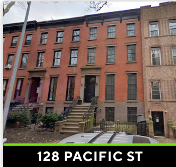
128 PACIFIC ST