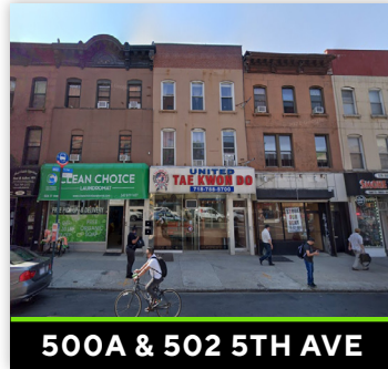
500A & 502 5TH AVE