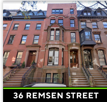
36 REMSEN STREET