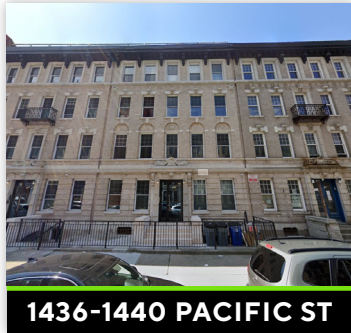
1436-1440 PACIFIC ST