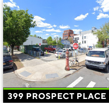
399 PROSPECT PLACE