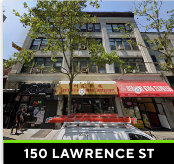
150 LAWRENCE ST