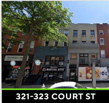
321-323 COURT ST