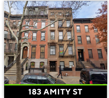
183 AMITY ST