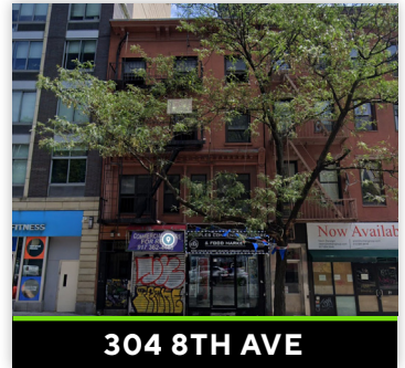
304 8TH AVE