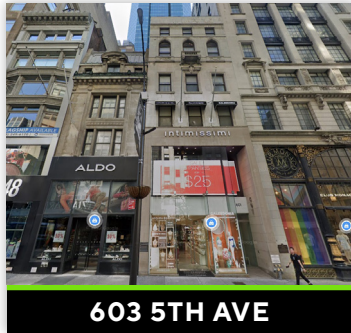
603 5TH AVE