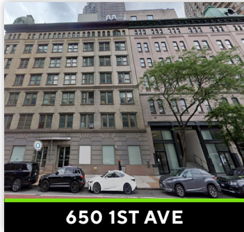
650 1ST AVE