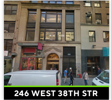
246 WEST 38TH STR