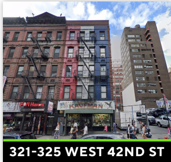
321-325 WEST 42ND ST