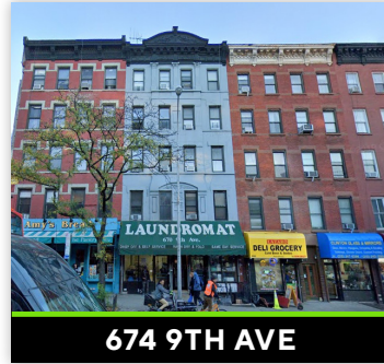
674 9TH AVE