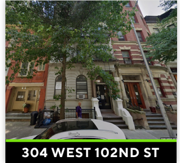
304 WEST 102ND ST