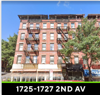
1725-1727 2ND AV