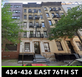
434-436 EAST 76TH ST