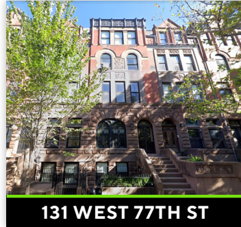
131 WEST 77TH ST