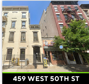
459 WEST 50TH ST