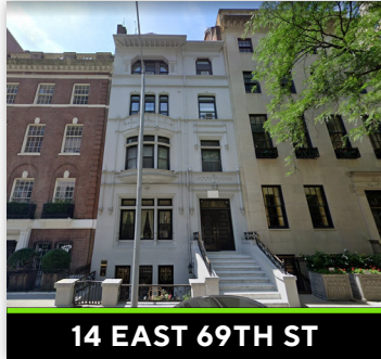
14 EAST 69TH ST