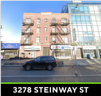
3278 STEINWAY ST