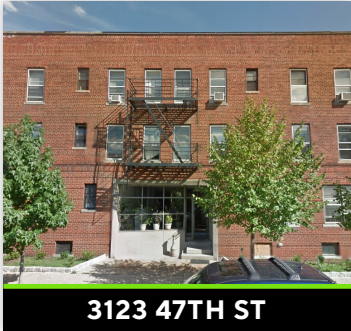
3123 47TH ST