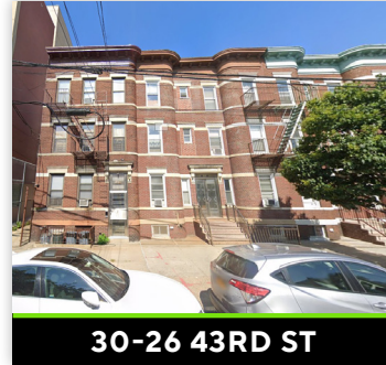
30-26 43RD ST