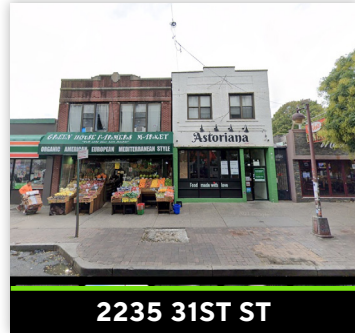
2235 31ST ST