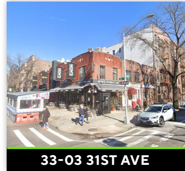
33-03 31ST AVE