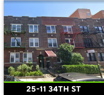
25-11 34TH ST