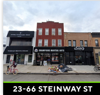
23-66 STEINWAY ST