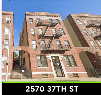
2570 37TH ST