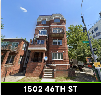
1502 46TH ST