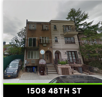
1508 48TH ST