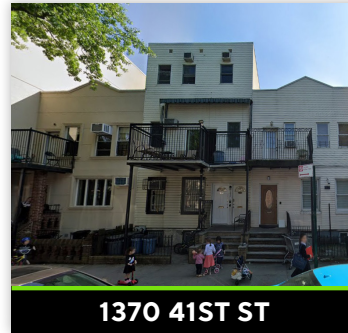
1370 41ST ST