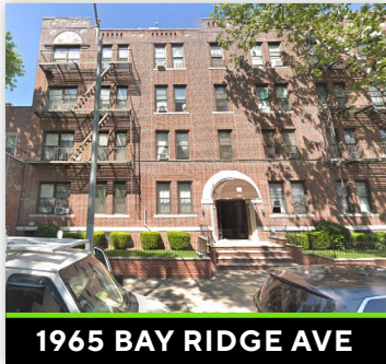
1965 BAY RIDGE AVE