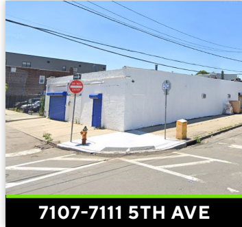
7107-7111 5TH AVE