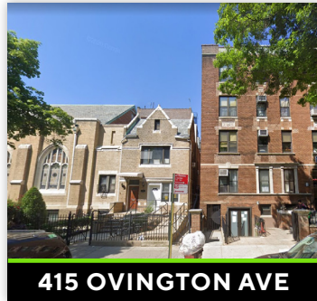
415 OVINGTON AVE