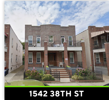
1542 38TH ST