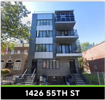
1426 55TH ST