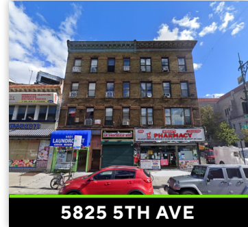
5825 5TH AVE