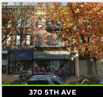
370 5TH AVE