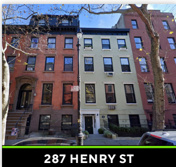
287 HENRY ST