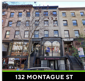
132 MONTAGUE ST