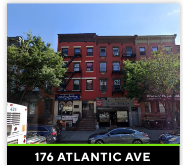
176 ATLANTIC AVE