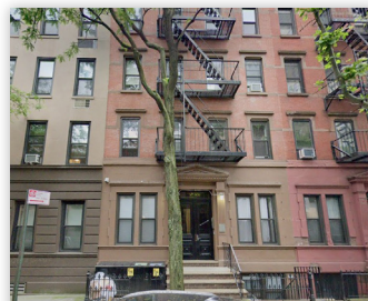
506 EAST 84TH ST