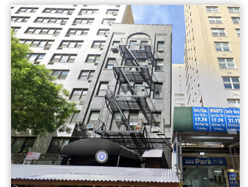
339 EAST 75TH ST