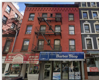
240 EAST 28TH ST