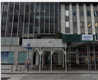
1200 6TH AVE